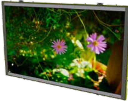
Optional Bezel Assembly